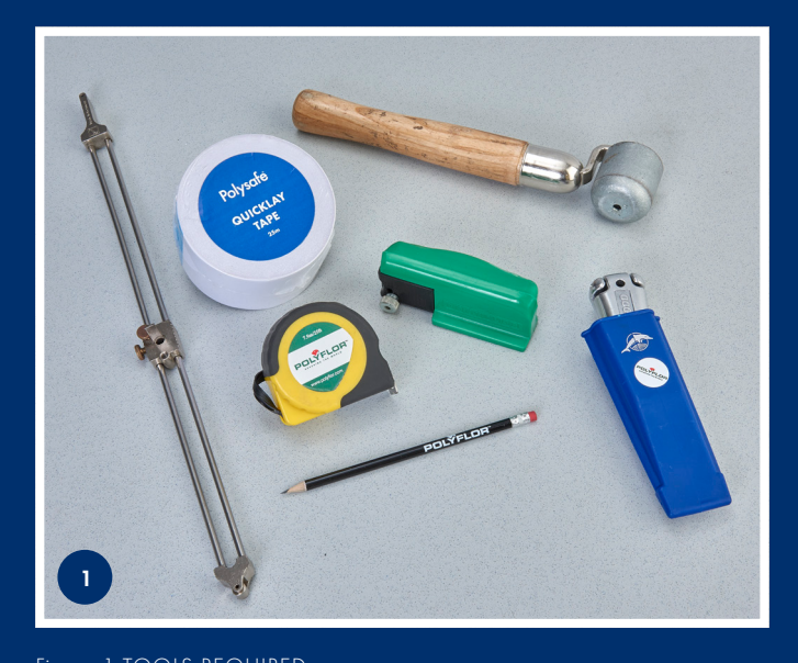
Figure 1 TOOLS REQUIRED