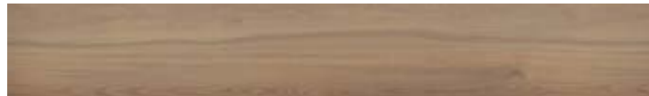
2410 WASHED PINE