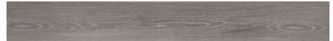
2418 SILVER BIRCH