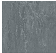
Flint 3720 w/r 3720 NCS S 5502-B LRV 25 ■ ■ +