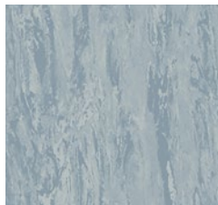
Blue Nickel 3730 w/r 5350 NCS S 3010-R90B LRV 39