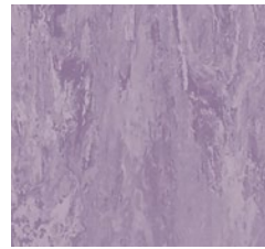
Amethyst 3780 w/r 3780 NCS S 3020-R50B LRV 36