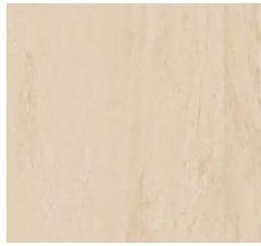
Carnelian Beige 3890 w/r 5330 NCS S 1510-Y30R LRV 61 ■ +