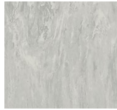
Pumice 3700 w/r 2650 NCS S 2000-N LRV 54 ■ ■ +