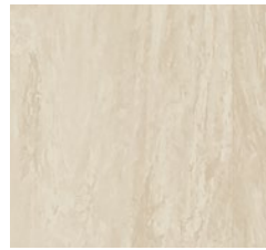
Porcelain 3880 w/r 3880 NCS S 1505-Y30R LRV 58 ■ +