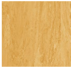
Citrine 3930 w/r 2660 NCS S 2030-Y20R LRV 46