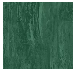
Jade 3830 w/r 2520 NCS S 6020-G LRV 14