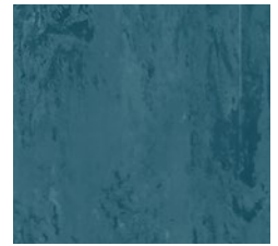
Dark Sapphire 3820 w/r 2530 NCS S 5020-B30G LRV 18