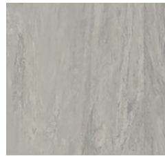
Fossil 3710 w/r 3710 NCS S 3000-N LRV 41 ■ ■ +