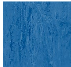
Tanzanite Blue 3750 w/r 3750 NCS S 4040-R90B LRV 19