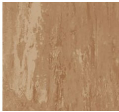
Sablee Beige 3900 w/r 2510 NCS S 4020-Y30R LRV 29