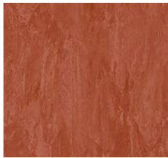
Ironstone 3850 w/r 3850 NCS S 4040-Y70R LRV 18