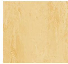
Opal 3920 w/r 2670 NCS S 1020-Y10R LRV 60