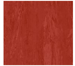
Ruby 3840 w/r 2560 NCS S 3060-Y80R LRV 14