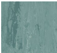
Turquoise 3810 w/r 2610 NCS S 4010-B70G LRV 31