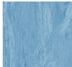
Crystal Blue 3740 w/r 3740 NCS S 2030-R90B LRV 38 ■