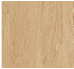
Dolomite 3910 w/r 2500 NCS S 3020-Y20R LRV 41 ■ +