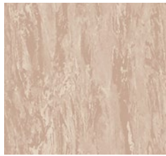
Rose Quartz 3870 w/r 3870 NCS S 2005-Y50R LRV 56